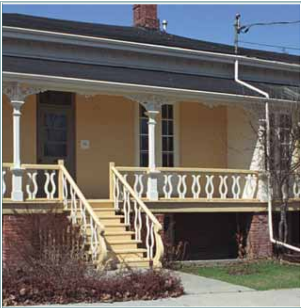
Features of the Regency style include exuberant designs for verandah treillage, and openings onto verandahs are often glazed doors.