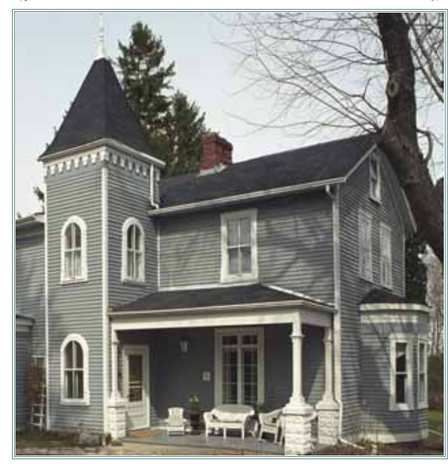
The front two-storey L-shaped section with gable roof facing Yeovil Street was a later addition. Windows have eared architraves which flare out at the sill, a typical detail of 1870's buildings.