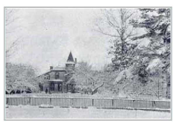
View of George Furby House in winter circa 1901 with a fence that once enclosed the property.