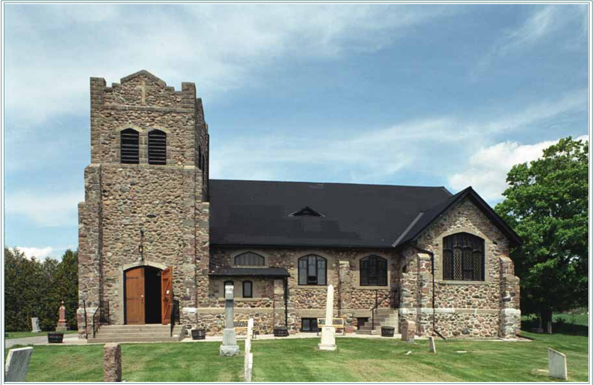
PERRYTOWN CHURCH circa 1914

Date Designated: September 15, 1992 to By-Law No. 3187, SCHEDULE B