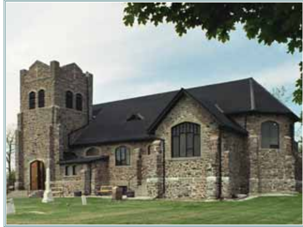
The church cemetery is located on the adjoining property.