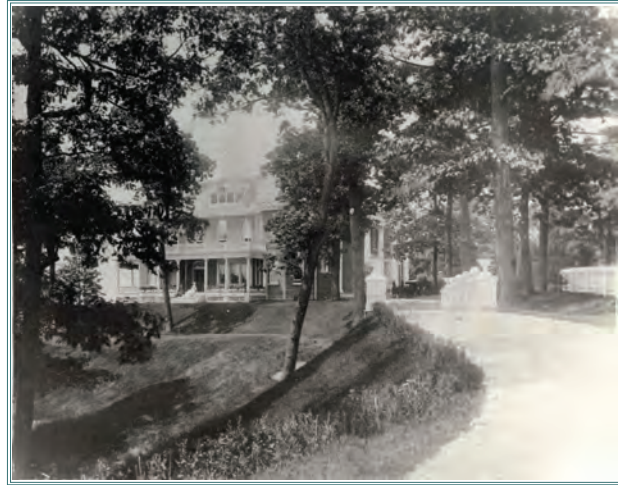
The main original portion of the house is the hipped roof section with two polygonal wings at each end. This section sports beautiful Palladian dormers, bracketed eaves and a grand verandah as viewed from the lake side in this archival photo.