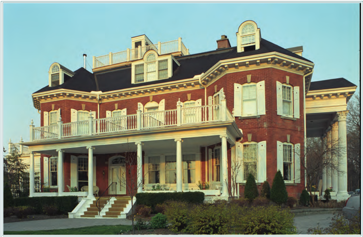
DAVID SMART HOUSE (THE HILLCREST)