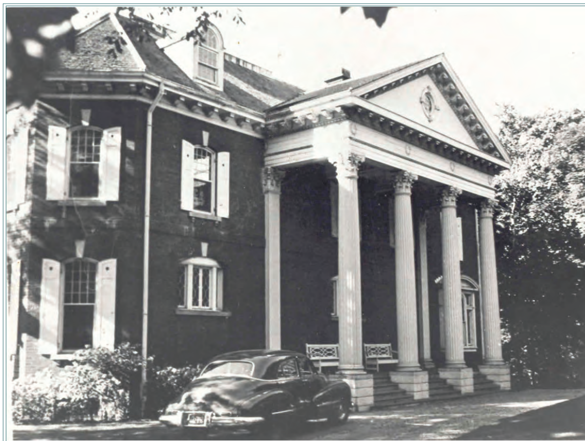
Top Archival Photo: The View from the Hillcrest circa 1901.