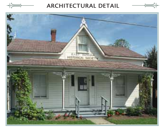
This is a house with very simple trim and woodwork and the front door case has sidelights. Vernacular in architectural expression, it makes use of local forms and materials, and incorporates familiar forms.

The East Durham Historical Society operates the museum that includes a garden and nature trail leading to the Ganaraska Conservation Park in Ward 2. The house is located in Garden Hill in Hope Township, an early farming community in which settlers cleared the land in the 1830's. Located by the Ganaraska River, the area also saw the development of grain, saw and woollen mills.