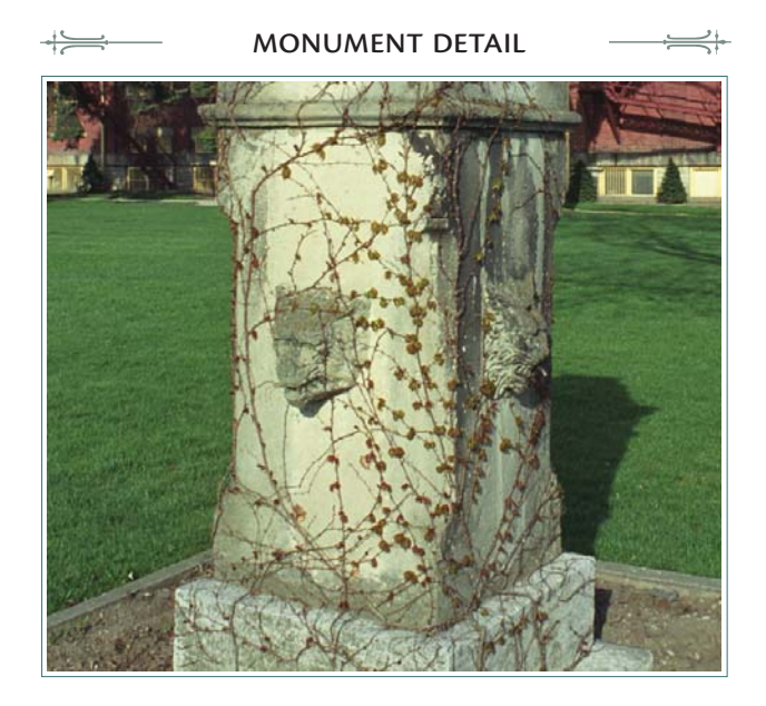
When functioning water pours from the mouth of each lion head in a stream originally into a trough below.

As an active member of the local Baptist congregation, he donated a piece of property for construction of the first Baptist Church on John Street (57 John Street) erected in 1869. Other philanthropic endeavours included Charter President of the Port Hope Benevolent Society when it was formed in 1862, and active supporter of the YMCA when it was first established in Port Hope on John Street in 1874. (50 John Street)