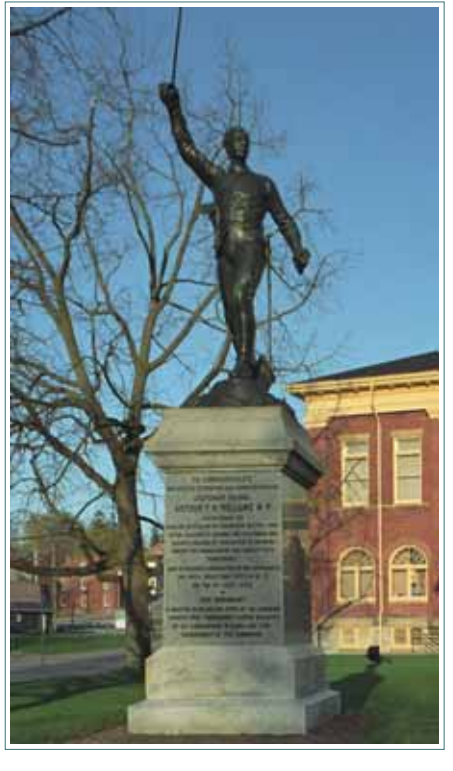
The eight foot statue stands on a base approximately nine feet in height.

The statue was cast in New York by the famous Henry Bonnard Bronze Co. It was officially unveiled by then Prime Minister Sir John A. MacDonald in 1889. The statue underwent extensive cleaning and restoration in 1995.