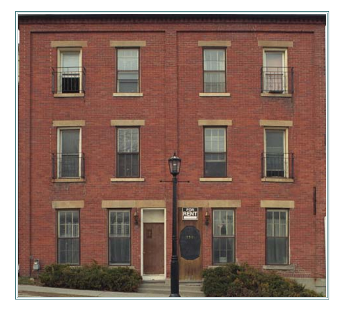
Perks Terrace is a three storey, four bay commercial type block of the transitional type with plain pilasters and frieze outlining the two units.