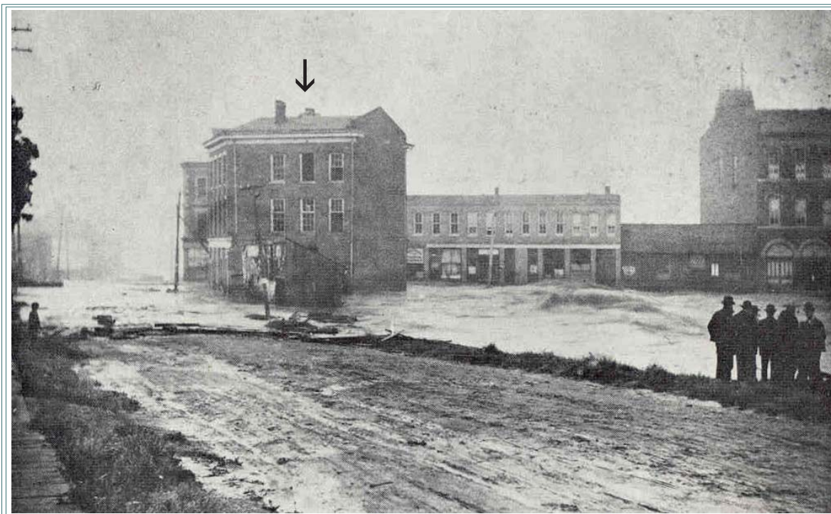
AFTER THE FLOOD, 1909, (PHOTO FROM EAST DURHAM HISTORICAL SOCIETY)