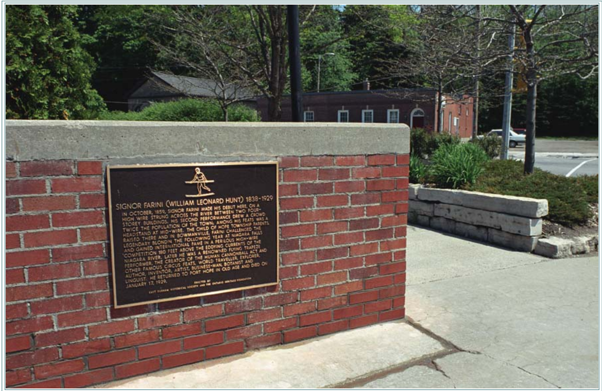
FARINI PARK (COMMEMORATING ORIGINAL BUILDING) circa 1848

Date Designated: April 21, 1986 to By-Law No. 28/86, SCHEDULE B-8