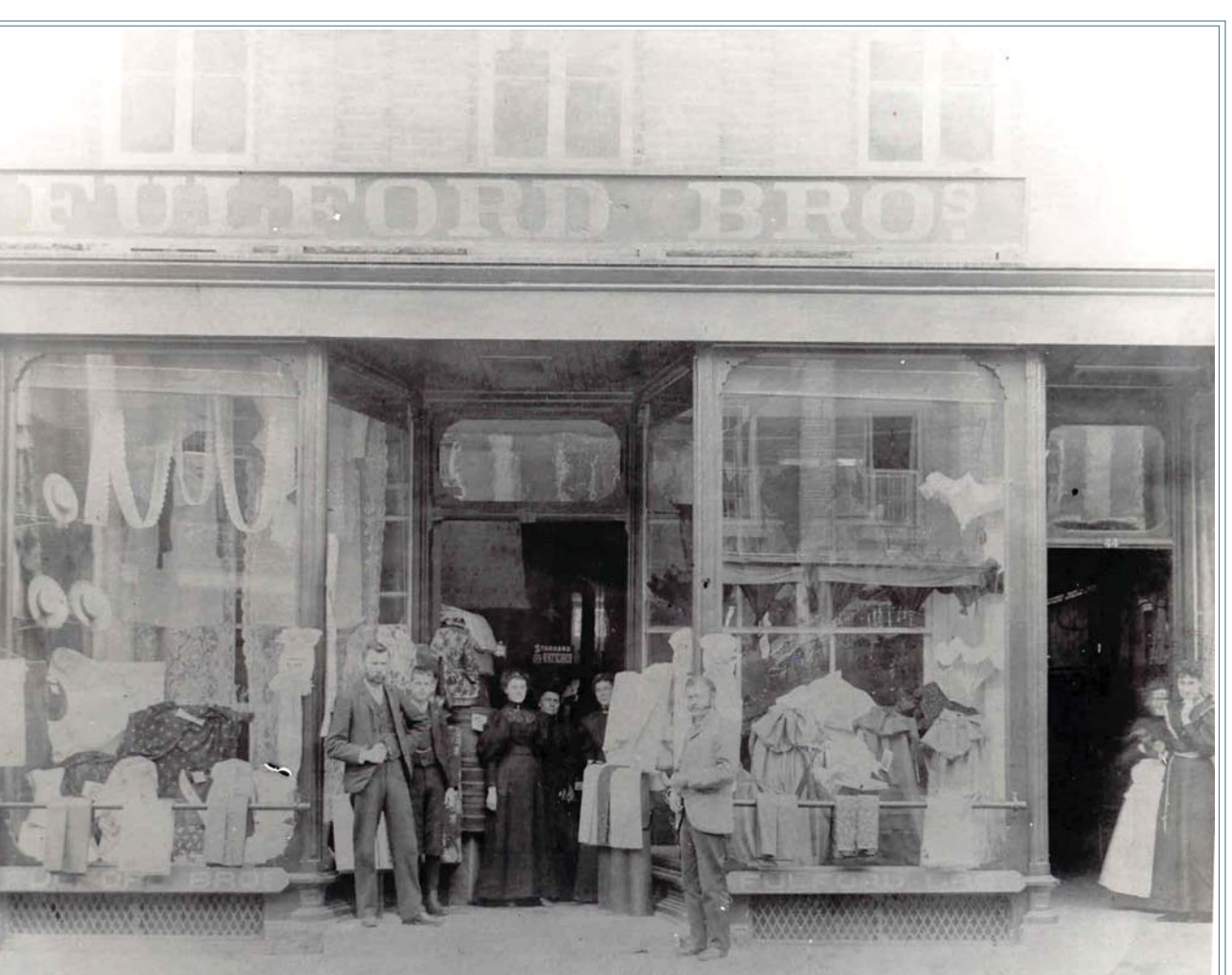
The Fulford Brothers remained in business in Port Hope from 1892 to 1975 when they sold the building to Long Brothers Limited. In a business directory listing, their business was described as general dry goods.