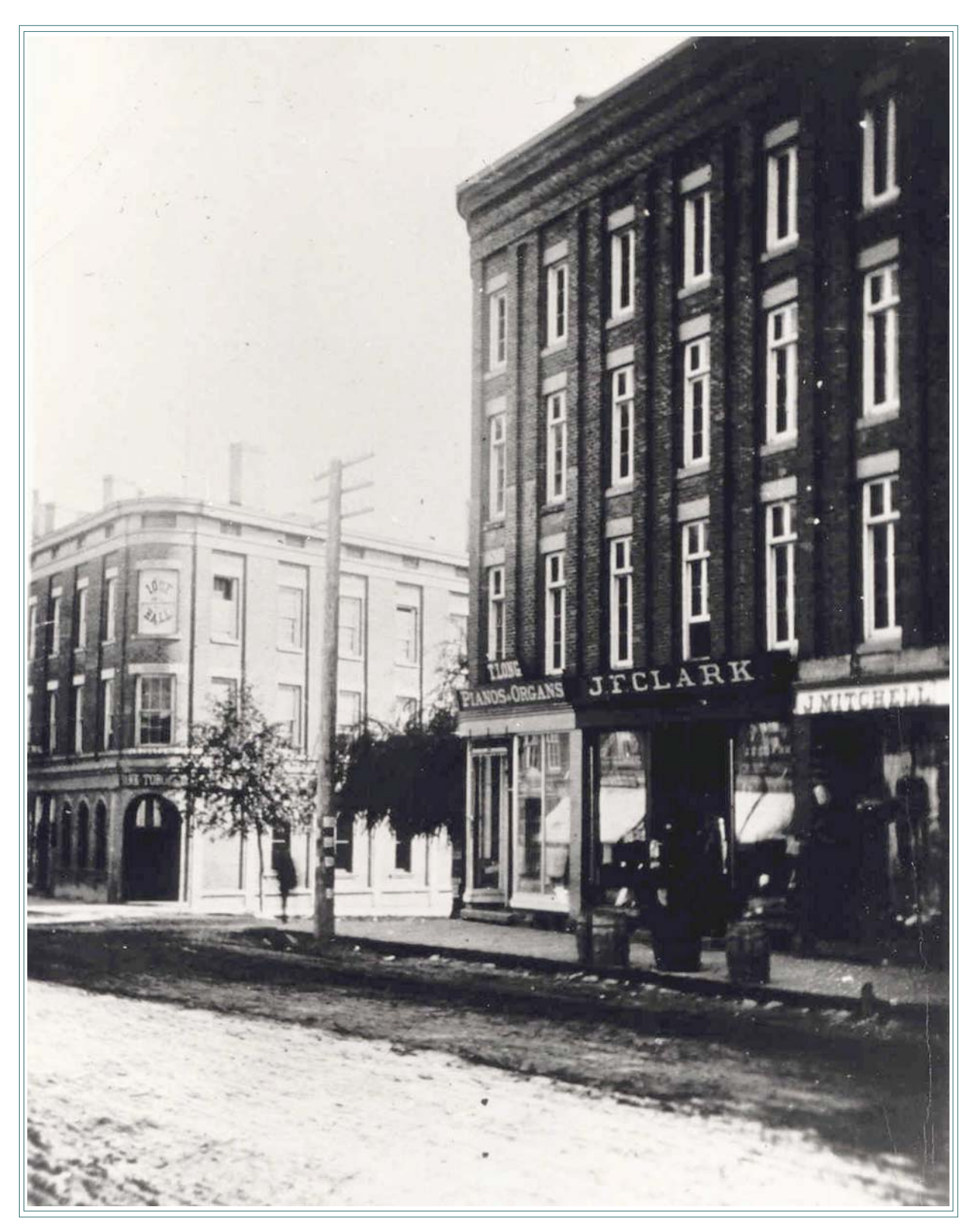
J.F. Clark, an active member of the Trent Valley Canal System, occupied the building before the Fulford Brothers in 1892. The neighbouring building on the corner at Queen has its fourth floor intact.